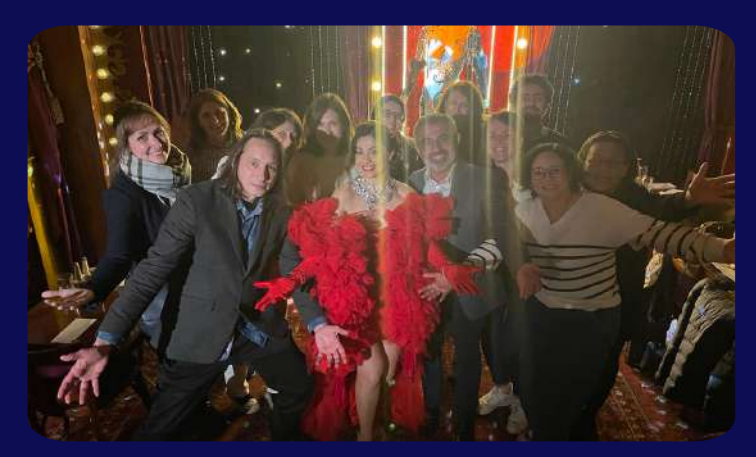
Click here to take a look around!